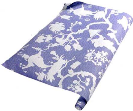
LAVENDER DREAM Add a light touch of color with a traditional pattern interpreted in a thoroughly modern way. Schumacher Shantung Silhouette Print Wallcovering in Wisteria, available to the trade; feschumacher.com